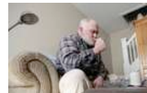
Michigan's Parole Town