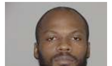
Michigan's five worst offenders