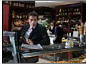
'Zen': Brits do right with mysteries