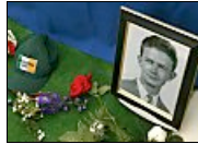
World War II soldier laid to rest