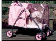
Are 'furbabies' replacing kids?