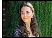
Kate Middleton's fashion diary