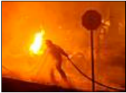
San Bruno rips findings on blast