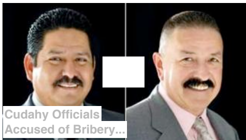
Cudahy Officials Accused of Bribery...