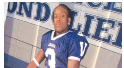
Top News Photos: Los Angeles