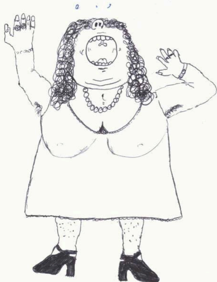
«The Swedish Model»

“How is it possible to come up with such twisted horror so openly? Swedish politicians have managed to design a law which is inherently malign. This nation is clutching on to the law, despite its evident and catastrophic aftermath.